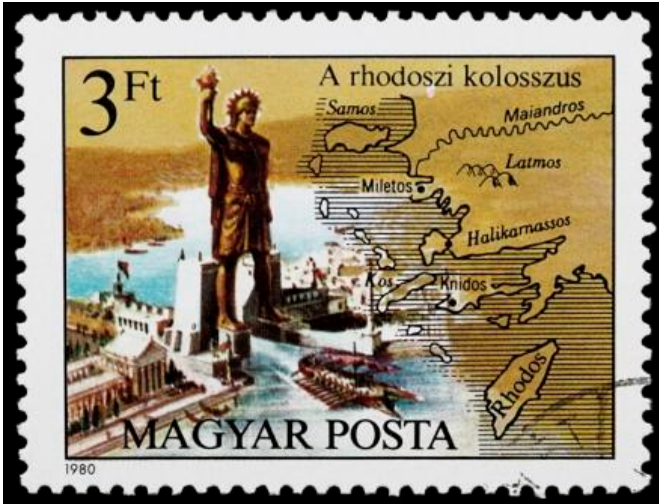
Colossus of Rhodes, ~304 B.C. Wonder of the Ancient World

How do allusions help to unlock the meaning of a poem?